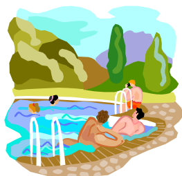
The Pool Club Party on May 30th will be a blast!