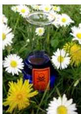
Public gardens are a source of informal science and beauty!

Summer is the perfect time to take advantage of informal science opportunities with your family travel plans!