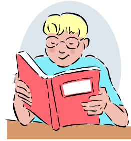
Pick up some books at the Spring Book Fair in June!

In June the media center will host our annual spring book fair . Students will visit the book fair with their language arts classes on June 10, 11 or 12 . A variety of popular fiction, world records books and sports books will be available – including books from the district's summer reading list. This is a fantastic chance to pick up some fun summer reads!