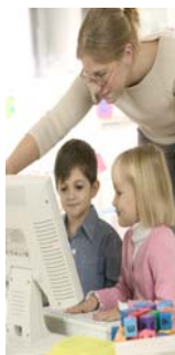
Stay in the loop!

Thanks to all of our students, and have a great summer!