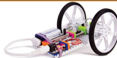
Invent a Self-Driving Vehicle

Science • Technology • Engineering • Math